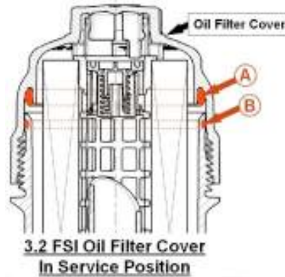
Figure 2. The 3.2 FSI oil filter cover in service position.