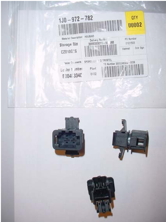
Plug Housing #1J0972782 Quantity Required: (1)

The following parts can be purchased from a Volkswagen dealer in order to assemble a brake control wiring harness that will plug into the vehicle brake control connector: