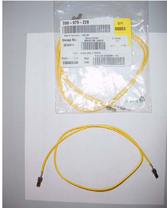
Wires and Connectors # 000979228 Quantity Required: (2)

The cavities on the connector housing are numbered and the connector can be connected to the brake control as follows: