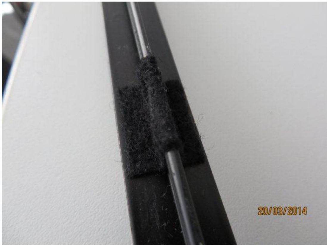
Figure 3: Fleece tape section applied.

2. The number of retaining clips will vary by model. A piece of dampening tape (fleece adhesive tape 533867910A) will be applied to each clipping point. Cut pieces of the tape 25mm long (Figure 2).