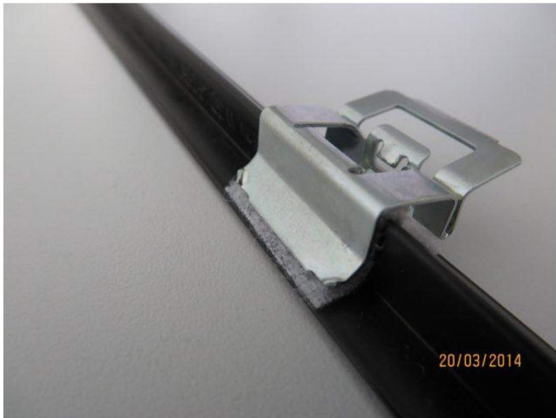
Figure 4: Retaining clip isolated with the fleece tape.