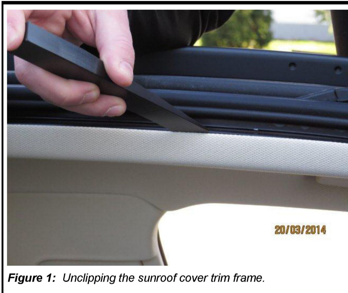
Figure 1: Unclipping the sunroof cover trim frame.