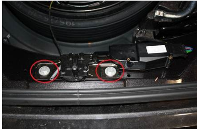
Figure 4. Power lid's motorized striker plate bolted mounting.

Tip: Use a permanent marker to mark original position in case striker adjustment is needed.