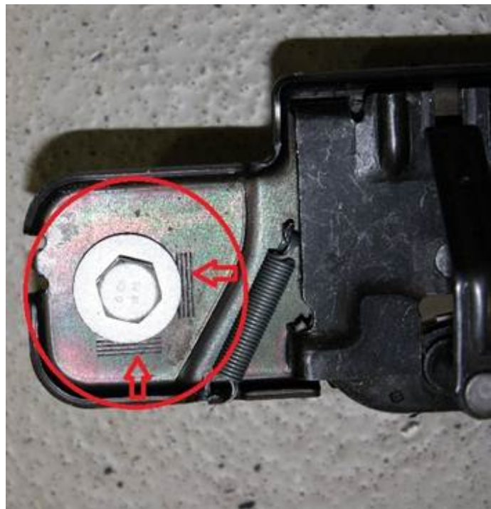
Figure 5. Power lid's motorized striker plate adjustability and serrated indicators.