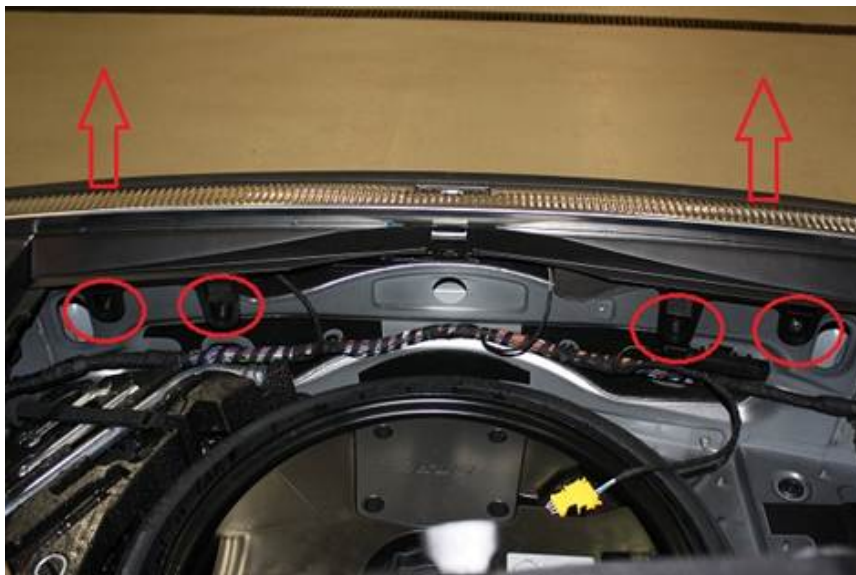
Figure 2. Rear cargo area trim plate removal. The T25 Torx® screws to be removed are circled in red.