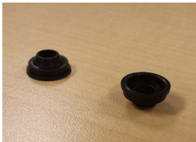
Figure 3. Spacers for underneath paddle switch assembly.

Tip: If factory service parts are not available, improvise by using spacers with dimensions of no less than 5.5mm I.D., no greater than 13mm O.D., and no thicker than 5.6mm.