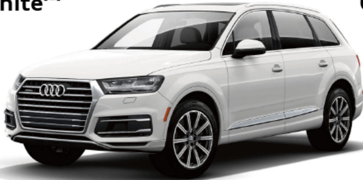
Carrara White [1]