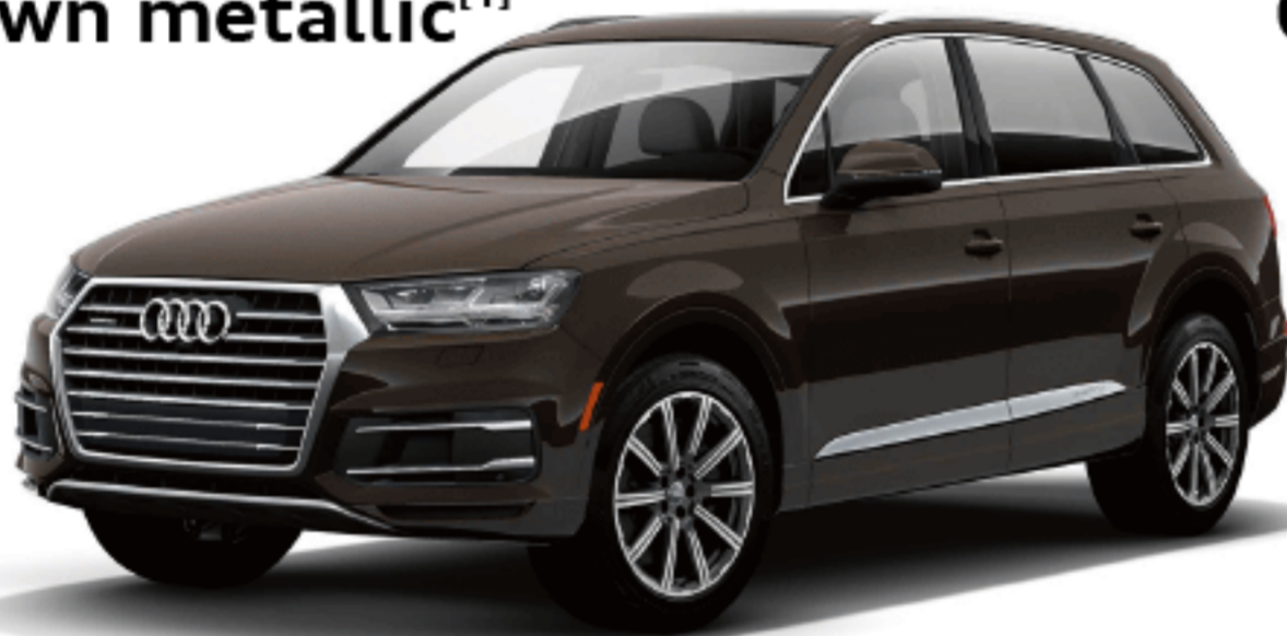
Argus Brown metallic [1]