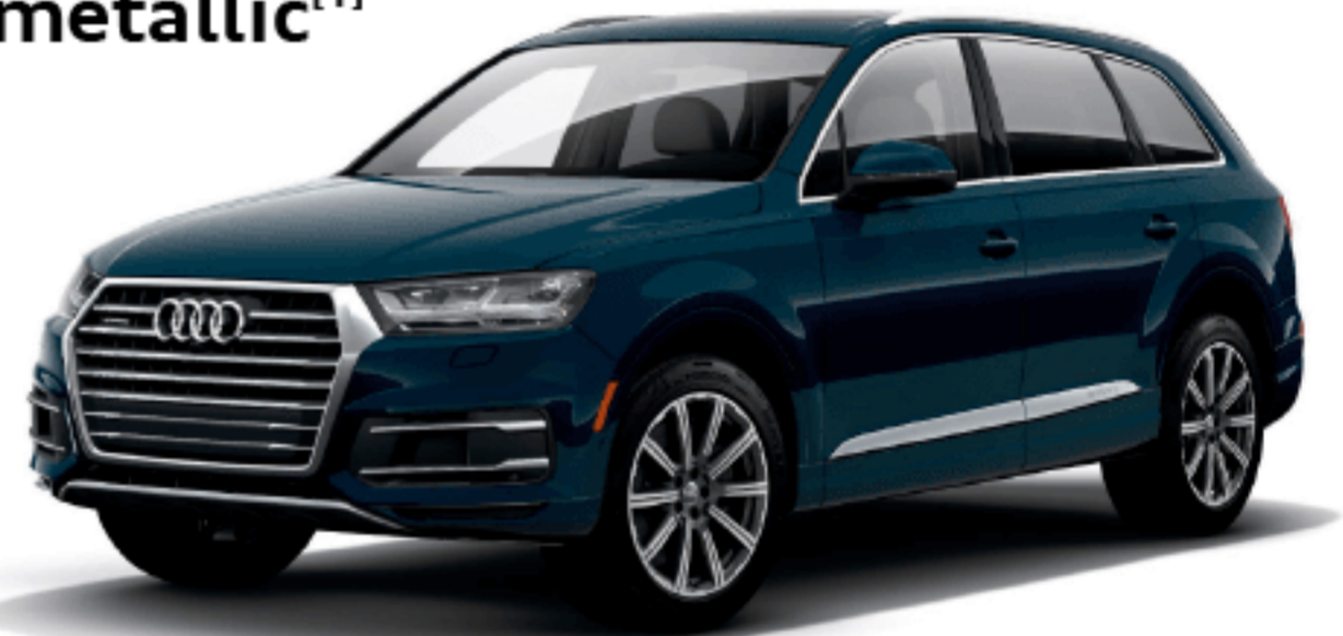
Galaxy Blue metallic [1]