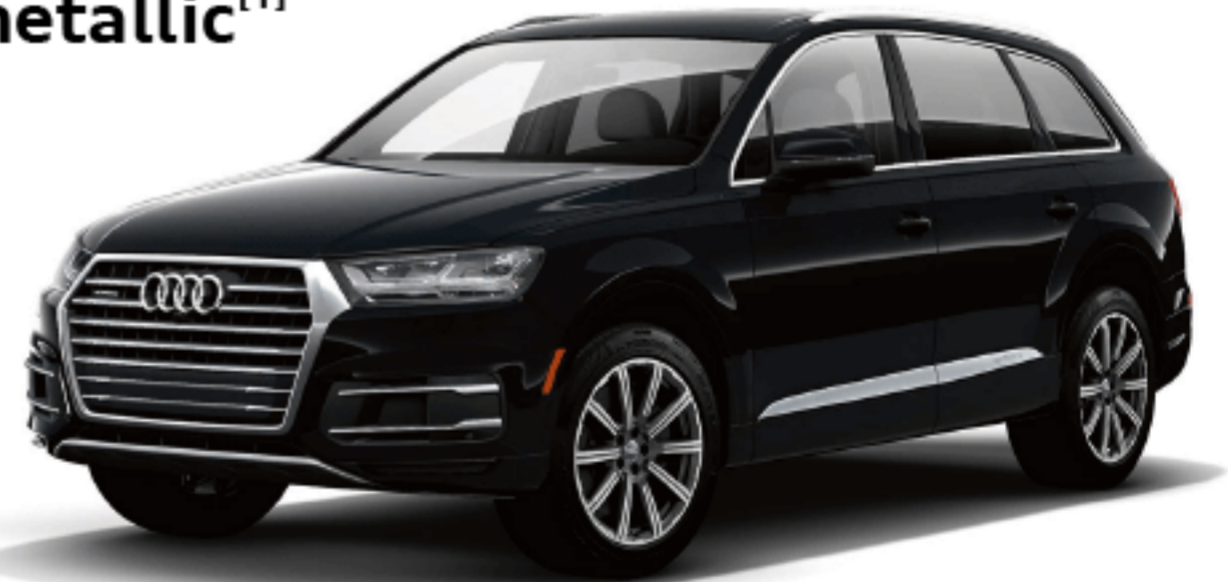
Orca Black metallic [1]