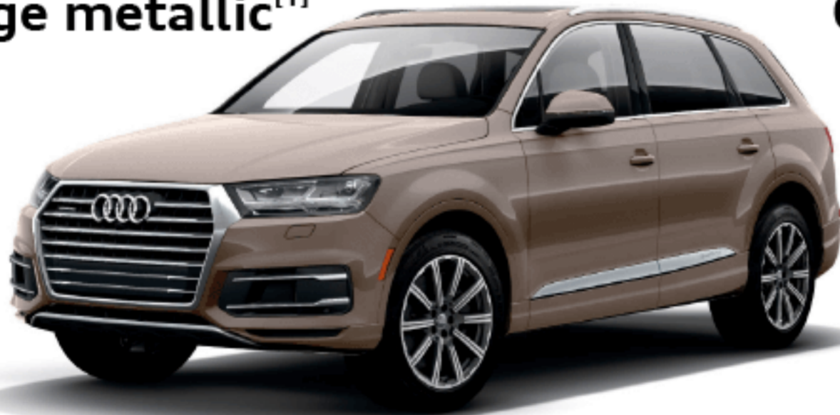
Cobra Beige metallic [1]