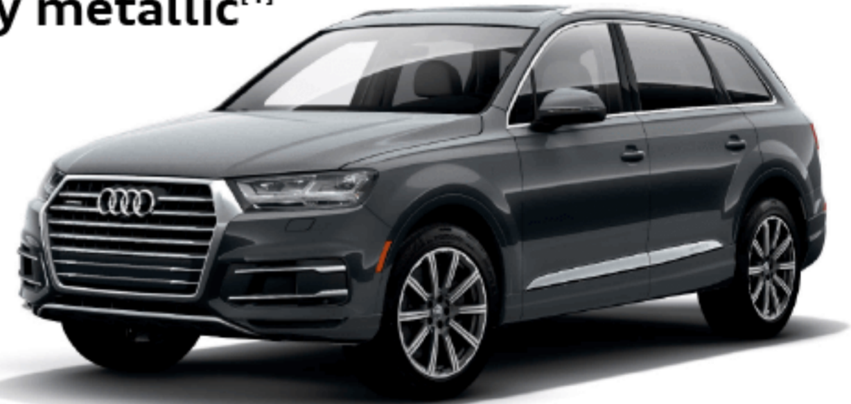
Samurai Gray metallic [1]