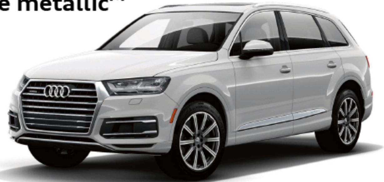
Glacier White metallic [1]