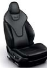
S sport seat